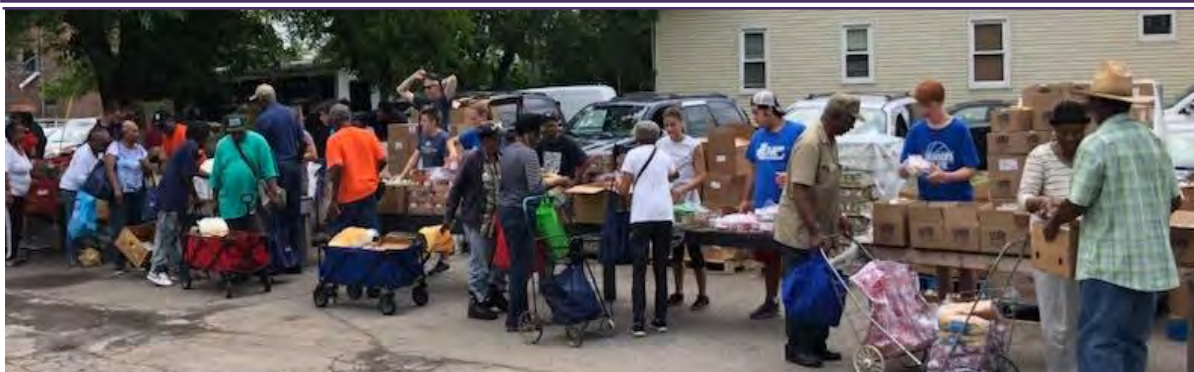
RPC Youth Mission Trip to Detroit, 2018. Serving over 150 people at a local Food Pantry.

Given the necessary and immediate work to be done on the outside of building and the need to have it done in good weather, Session determined that we should get started in late spring rather than taking the time to run a capital campaign first. Session authorized securing a loan, using a portion of RPC's invested funds as collateral. Given the return RPC is currently enjoying on its investments, and the favorable interest rate obtained on a loan, it was fiscally responsible to use our investments as collateral rather than liquidating them to cover the costs of renovation. Funds raised in this campaign will pay off the loan over the next three years.