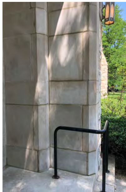
South narthex stone before (left) and after repair.