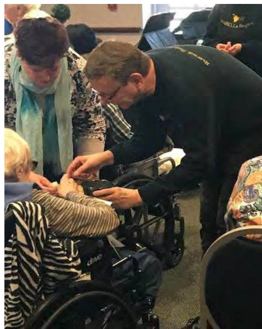
Worshipping and Celebrating Communion with residents, Fifth Sunday Mission at Caledonia