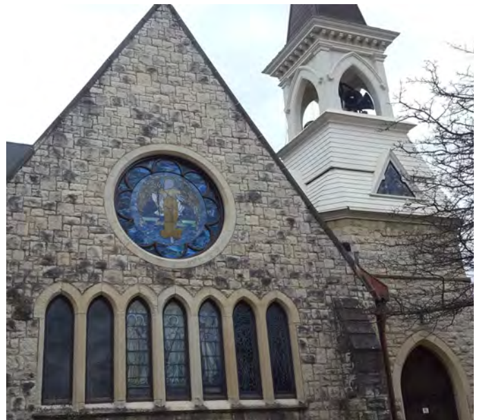
Remember how our church home looked before the stones were cleaned? Look on the front cover (or just stand outside!) to see the "after."

The wood and stucco elements on the exterior of our building are also in need of attention. That work has started with rotted wood being replaced, windows resealed, and all of the exterior non-stone surfaces soon to be painted. Repair of plaster and painting has also happened inside on the walls of the sanctuary, both entryways, and the area outside of the accessible restrooms. Randex Painting is handling the painting and repair work, inside and out, at a cost of approximately $36,000.