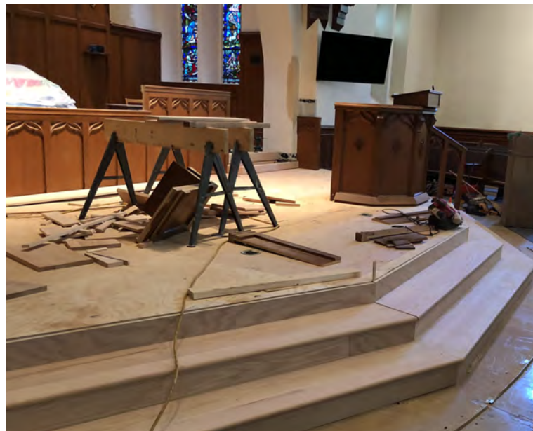
Chancel and choir loft renovations (above, in process, and left, completed) make the space more flexible for RPC events as well as community groups.

After much thought and discussion, Session determined that a capital campaign of this magnitude would benefit from the assistance of a professional. Administrative costs and professional expenses will run about $19,500.