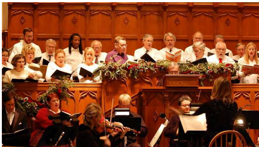
Annual Messiah performance, 2017

We encourage you to prayerfully consider the dollar amount you can pledge to help us secure a bright and lasting future for the programs and ministry of RPC that take place in our building.